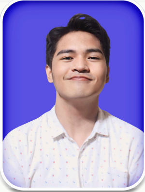
KEN EMRHO ALMODOVAR Graphics Layout