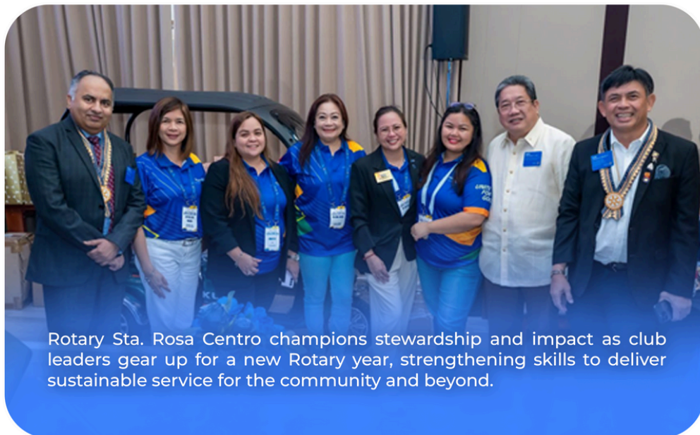
Rotary Sta. Rosa Centro champions stewardship and impact as club leaders gear up for a new Rotary year, strengthening skills to deliver sustainable service for the community and beyond.