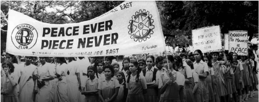
Women and school girls march in a peace parade sponsored by the Rotary and Rotaract clubs of Bangalore East, India, circa 1986.