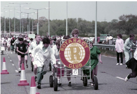
Rotaractors in England participate in a Bed Push race to raise money for the Birmingham Children's Hospital in 1984. The event organized by the Rotaract Club of Coleshill, England, was held in conjunction with the