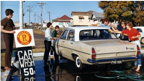
The Rotaract Club of Ipswich, Queensland, Australia holds a car wash as a club fundraiser in the early 1970s. Rotaract drew young people from many backgrounds.