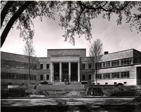
The world headquarters on Ridge Avenue in Evanston, Illinois, USA, near the end of construction in 1954.

In addition to its headquarters in Evanston, Illinois, USA, Rotary International has several offices worldwide.