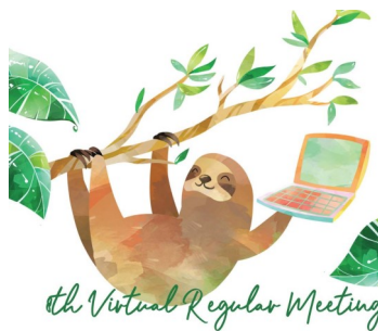
October 29 Meeting Invite