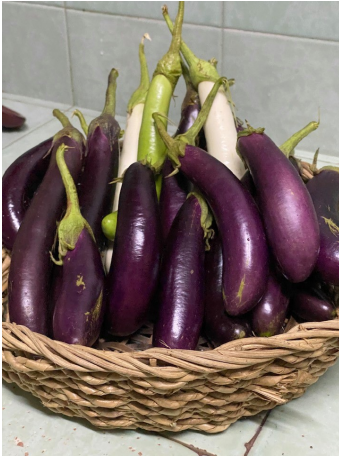
Produce from PP Zeny Dictado's backyard garden

After several months, Centronians were already able to harvest fruits/vegetables from their backyard garden.