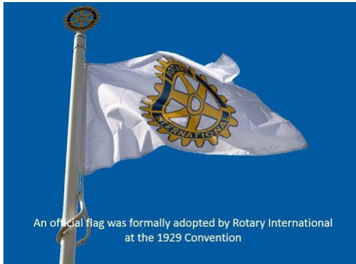
An official flag was formally adopted by Rotary International at the 1929 Convention

Some Rotary clubs use the official Rotary flag as a banner at club meetings. In these instances it is appropriate to print the words "Rotary Club" above the wheel symbol, and the name of the city, state or nation below the emblem.