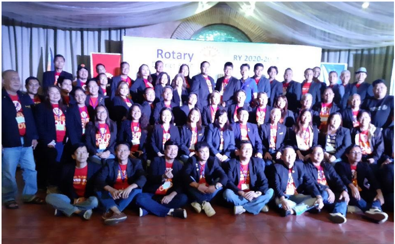
The Presidents for Rotary Year 2020-2021. Congratulations on your Pre-PETS!