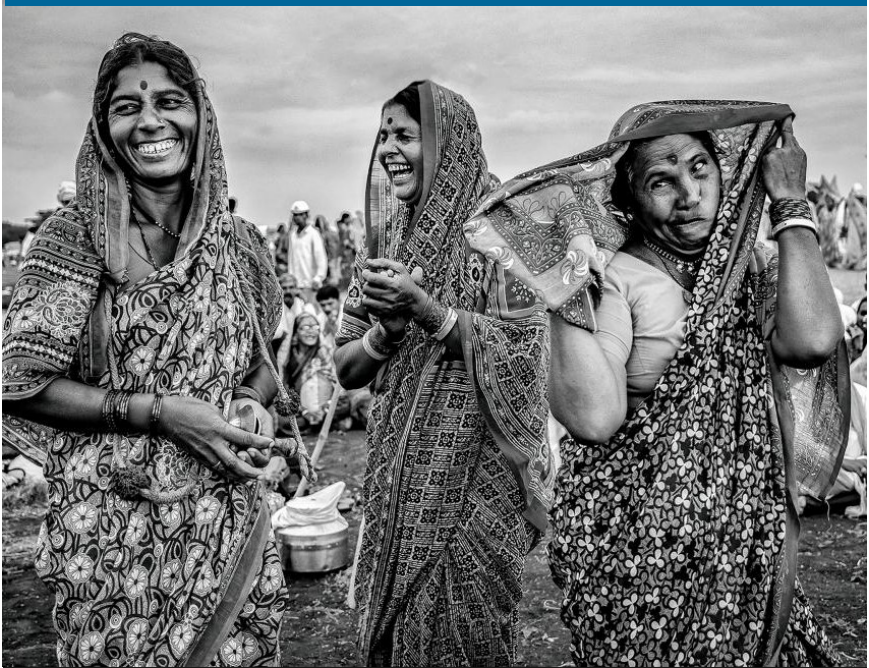
Second Place, ROTARIAN PHOTO CONTEST 2018