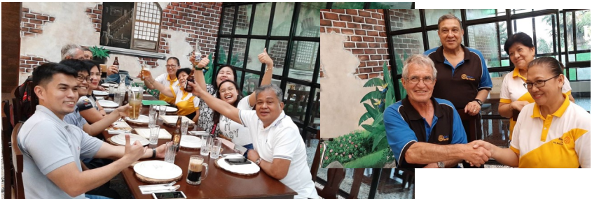
Dinner & Sister Club Agreement Signing at Concha's, Sep 28, 2019