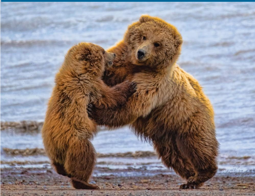
Honorable Mention, ROTARIAN PHOTO CONTEST 2019