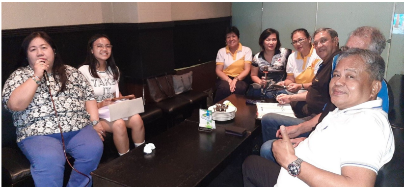
Music Plus Paseo de Sta Rosa, Sep 28, 2019