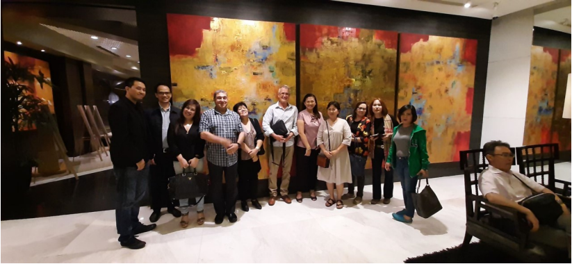
Vue Bar at Belleview, Sep 27, 2019