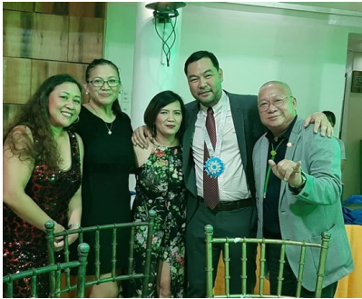
RC Tayabas & RC Tayabas Central