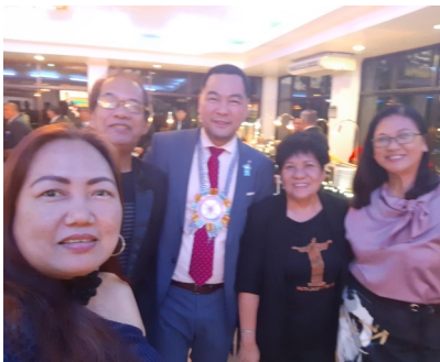
RC Lipa South