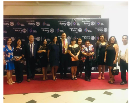
RC Batangas Mid-West