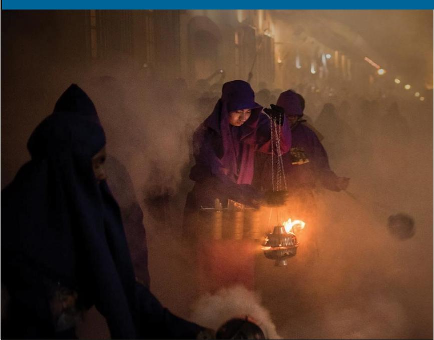
Honorable Mention, ROTARIAN PHOTO CONTEST 2019