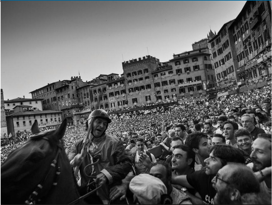
3rd Place ROTARIAN PHOTO CONTEST 2019