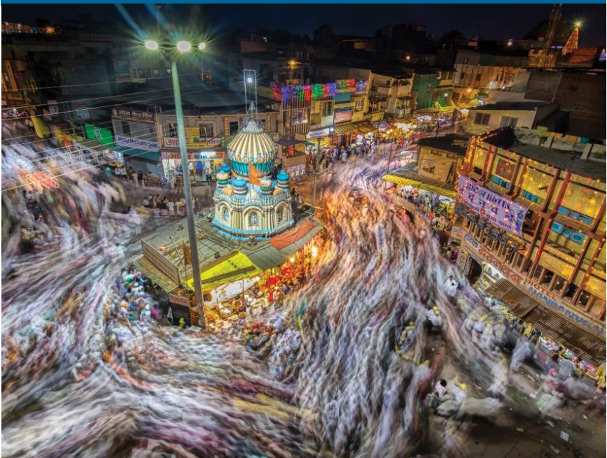
1st Place ROTARIAN PHOTO CONTEST 2019