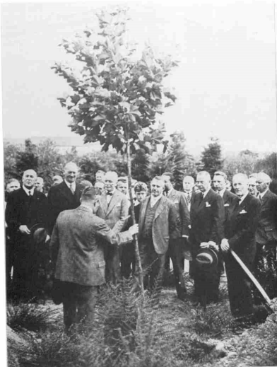
In 1932 Paul Harris planted his first European Friendship Tree (Maple) on the Tempelhofer Feld in Berlin, which has been and still is an airport.

Today, Rotarians continue to plant trees to symbolize enduring friendships and fellowship, to beautify parks and communities, and to contribute to a greener world.