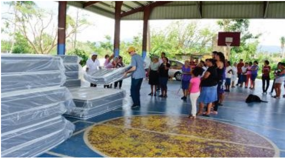
San Juan club members distribute mattresses in Villa Santo.