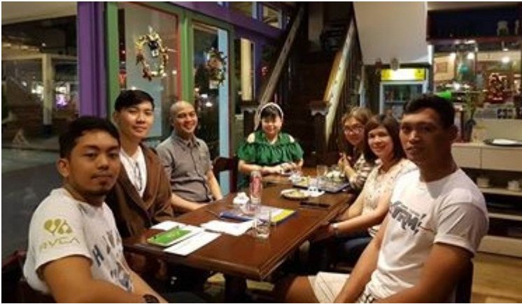
Centro and Rotaractors Meeting , November 29, 2018