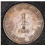
One of the earliest issues of one-peso leper coin. "Culion Leper Colony" was inscribed at the top, and "Philippine Islands" below.

6. Philippines' leper colony had their own "Leper Money."