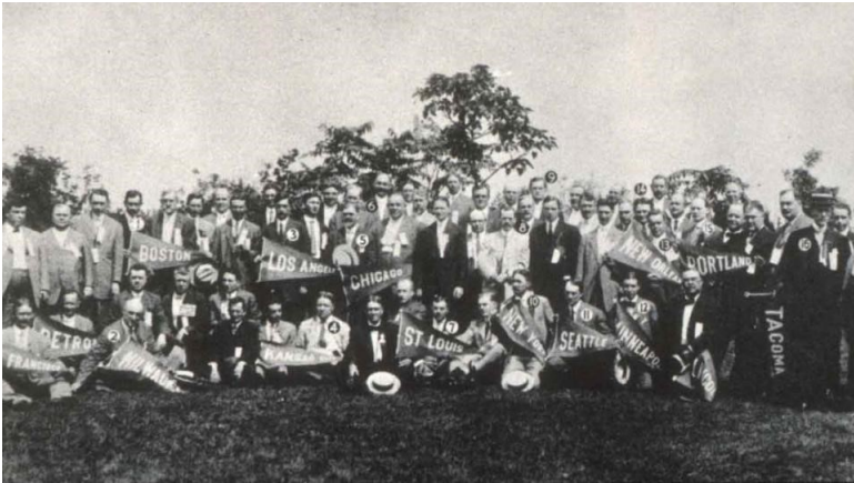
Rotary's first fiscal year began the day after the first convention ended. The convention of the Rotary Clubs of America was held in Rotary's birthplace, Chicago, in 1910.

At its August 1912 meeting, the Board of Directors ordered an audit of the International Association of Rotary Clubs' finances. The auditors recommended that the organization end its fiscal year on 30 June to give the secretary and treasurer time to prepare a financial statement for the convention and board, and determine the proper number of club delegates to the convention. The executive committee concurred, and at its April 1913 meeting, designated 30 June as the end of the fiscal year.