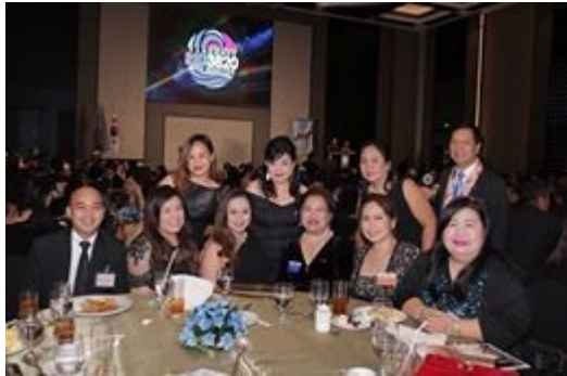
Centronians , dapper and beautiful in dramatic black..