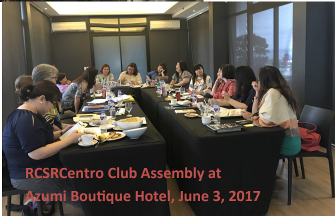
RCSRCentro Club Assembly at Azumi Boutique Hotel, June 3, 2017

District 3820 sim- ultaneous kick-off activity was attend- ed by ASP Evs, PPs Doray , Precy and PE Mich Baldemor