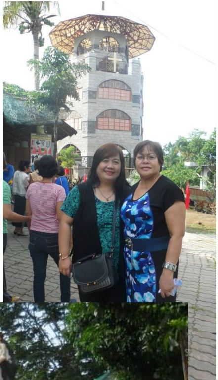
Blessing of St. Padre Pio Shrine's Mother of Mercy Belfry, Sto Tomas, Batangas