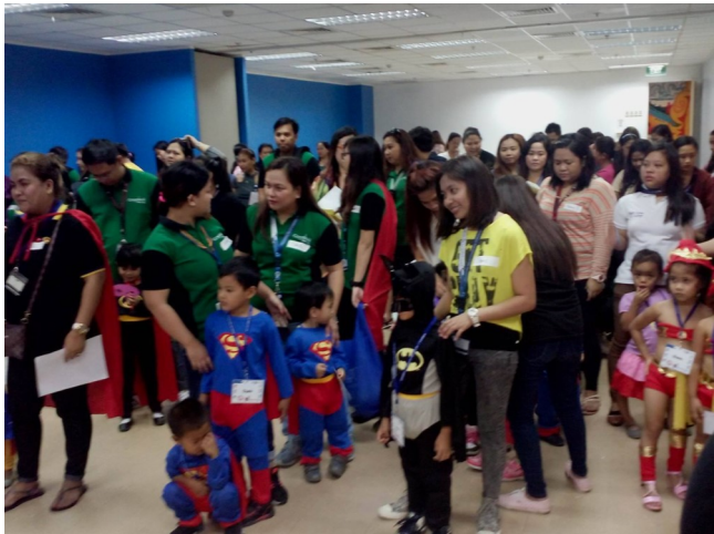
Kids from Pulong Sta. Cruz Daycare Center were given a chance to be a superhero for a day...