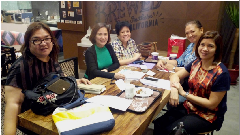
Special Board Meeting, January 23, 2017—Coffee Bean and Tea Leaf