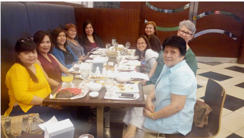
Regular Meeting, January 24, 2017, Sam's HK Chinese Restaurant, Vista Mall, Sta. Rosa