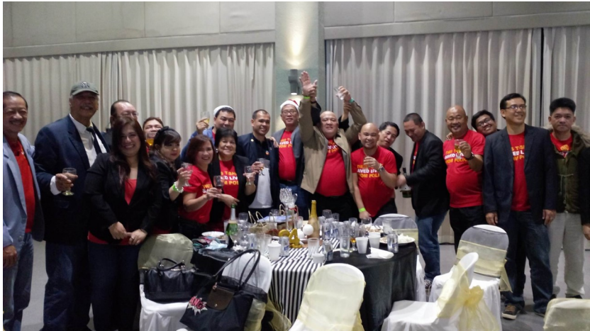
The Centro Ladies joins the fun with other rotarians at the District 3820 Christmas Party