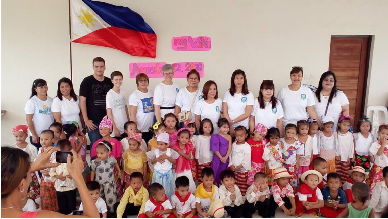
The Kids of Pulong Sta. Cruz Daycare with the Centro Ladies