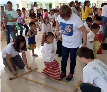
PP Doray & PP Liza teaching a kid how to dance the tinkling.