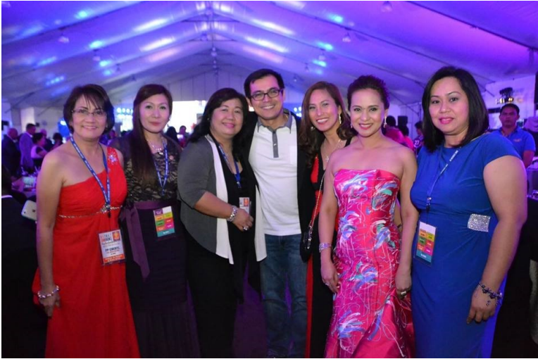
Ready for Fellowship Night... with Vice-Mayor Isko Moreno