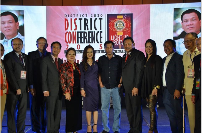
Davao Mayor Rodrigo Duterte is in the house..