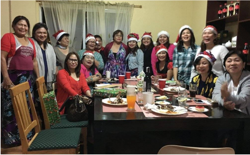
The Centro Ladies decorated their santa hats for the Christmas party.