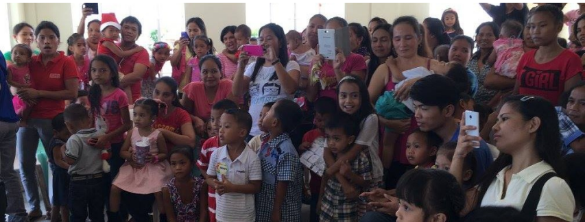
Pagoyo Day Care students and their parents, all ready for the games.