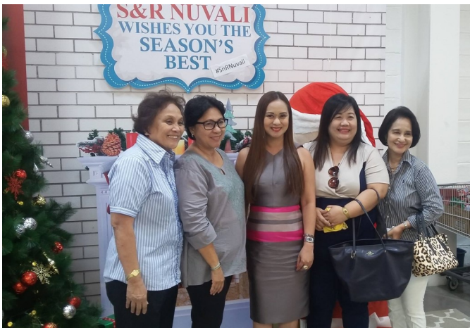
Centro Ladies gracing the opening of S&R, Nuvali.