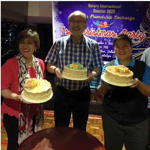
Happy Birthday December celebrants!!