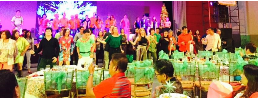
Dance Time with Rotarians