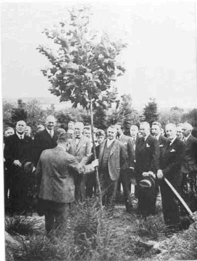
In 1932 Paul Harris planted his first European Friendship Tree (Maple) on the Tempelhofer Feld in Berlin, which has been and still is an airport.

Today, Rotarians continue to plant trees to symbolize enduring friendships and fellowship, to beautify parks and communities, and to contribute to a greener world.