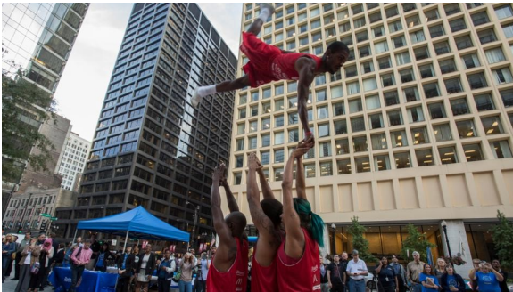
Participants in the Under One Sky event in Chicago on 24 September dance along to music performed by Funkadesi.