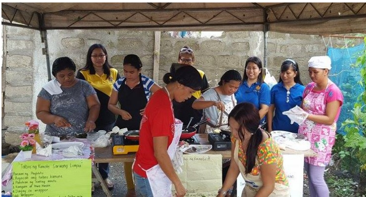
Talaga ng Kamote - Sarawang Lutas! Pananatili ng Pagkain - Bagaanan ng talaga kamote - Pakikipag-ugnayan sa - Sangayon ng mga bayan - Kung saan magluto - Sa bawat lugar.