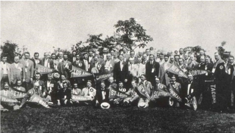
Rotary's first fiscal year began the day after the first convention ended. The convention of the Rotary Clubs of America was held in Rotary's birthplace, Chicago, in 1910.

At its August 1912 meeting, the Board of Directors ordered an audit of the International Association of Rotary Clubs' finances. The auditors recommended that the organization end its fiscal year on 30 June to give the secretary and treasurer time to prepare a financial statement for the convention and board, and determine the proper number of club delegates to the convention. The executive committee concurred, and at its April 1913 meeting, designated 30 June as the end of the fiscal year.