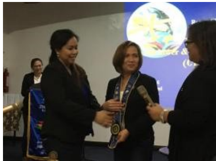
Transfer of Lei