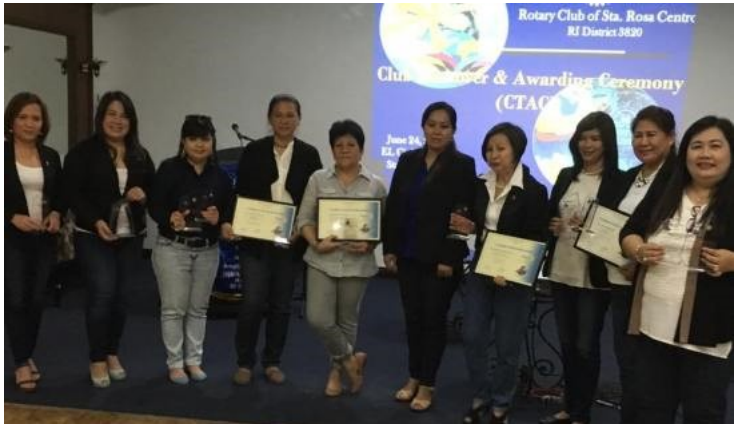
Awardees for the Rotary Year 2015-2016