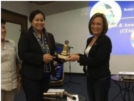
Turnover of Bell & Gavel