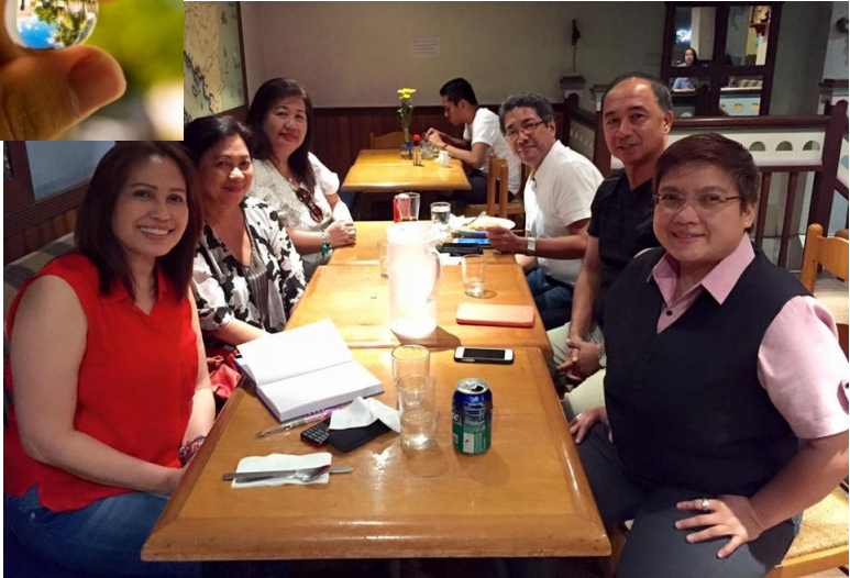
Preliminary Meet for the Rotary International D-3820 RFE (Rotary Friendship Exchange) Team held at Café Breton, Alabang last August 31, 2015