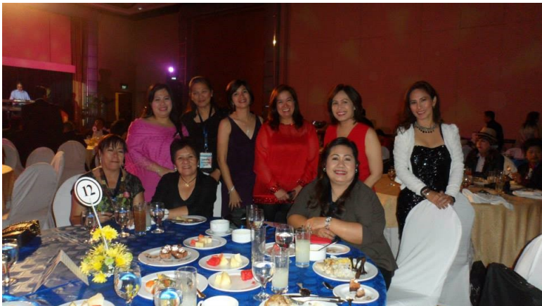
The Centro Ladies in their formal dress..