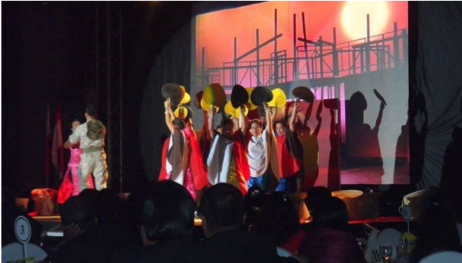
1st PLACE : RC Balayan - Miss Saigon