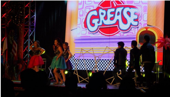
2nd PLACE : RC Lucena College Junction - Grease