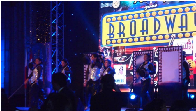
3rd PLACE : RC Lipa—Chorus Line