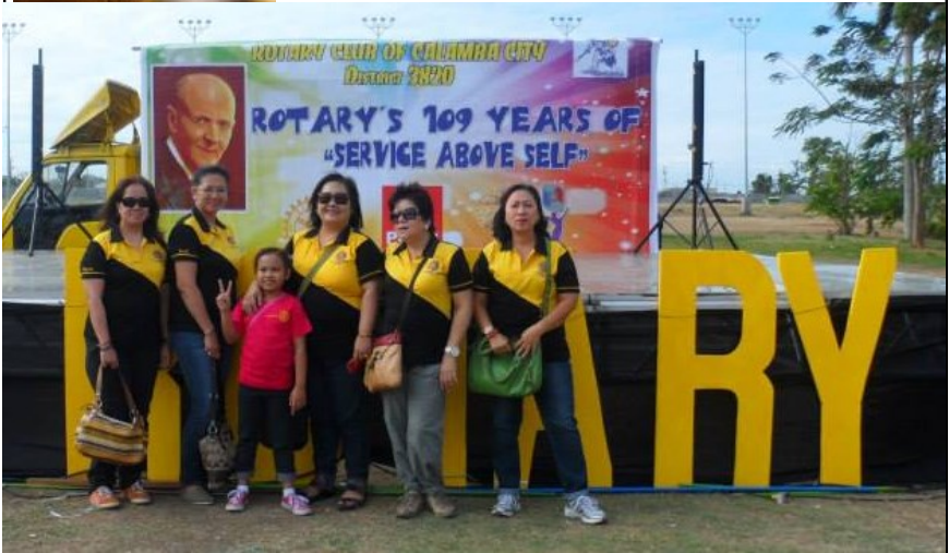
At Rizal Park, Calamba City