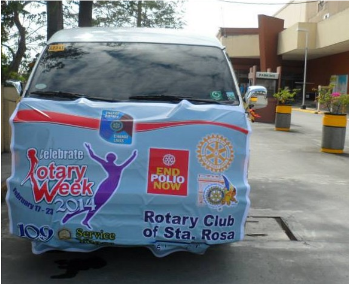
Meet-up for the motorcade..