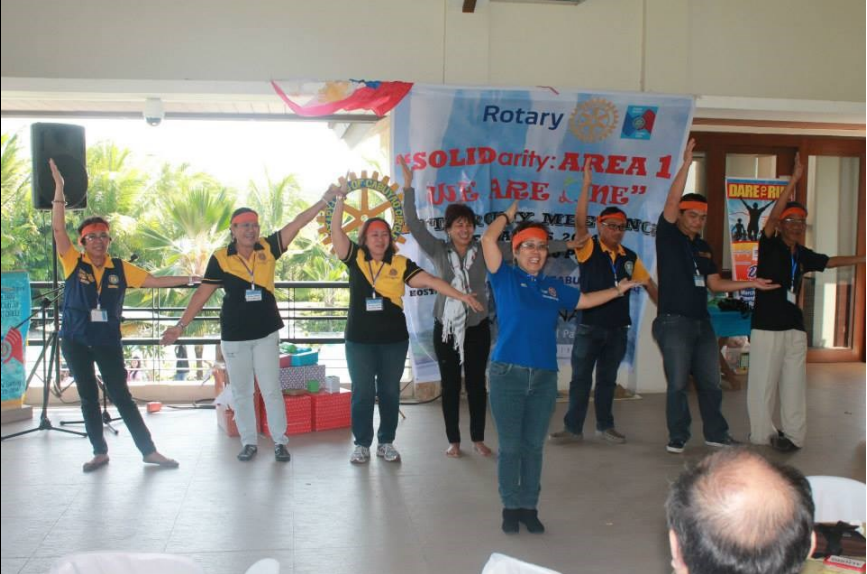
Cheering competition at intercity..