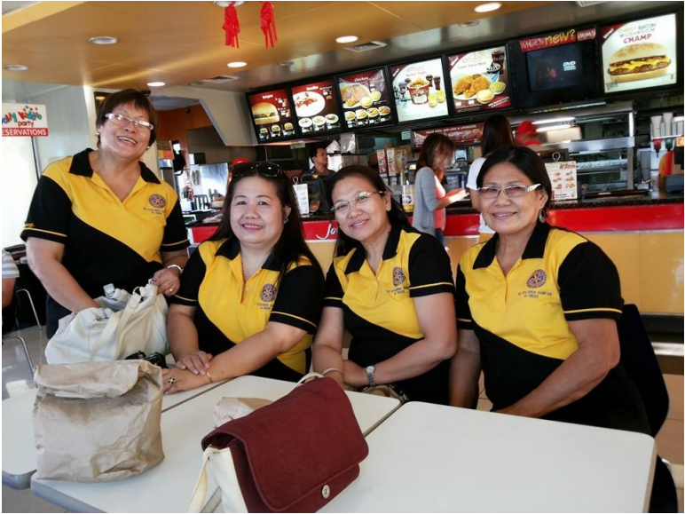
The Centro Ladies after gift-giving for Pagoyo Day-Care Center at Jollibee Caltex.