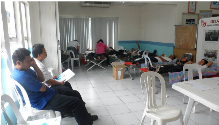
Team members wait for their turn as all the beds were occupied