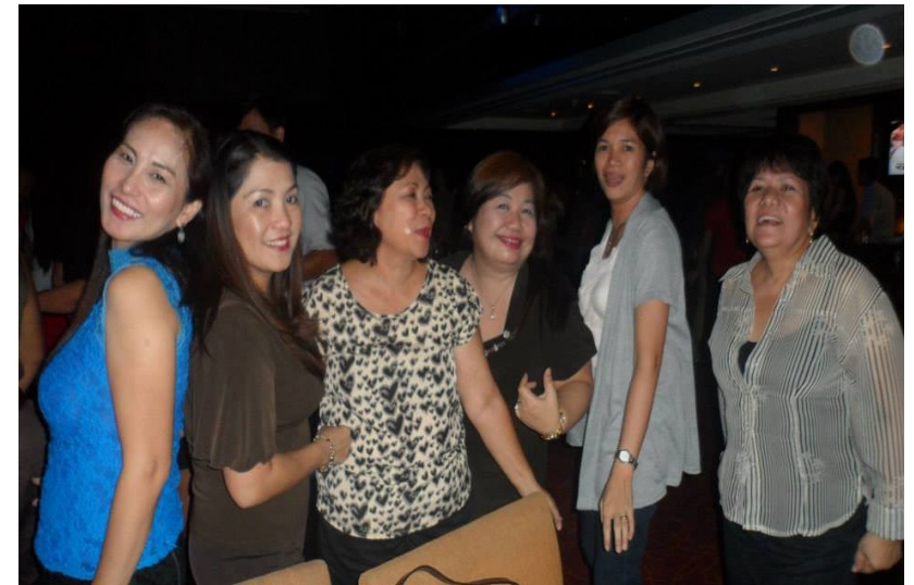
Centro ladies just wanna have fun.