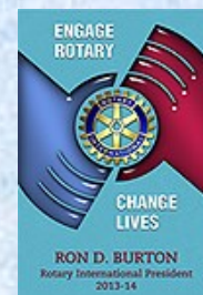
RY 2013-2014 Logo

Rotary Club of Sta. Rosa Centro RI District 3820 Outstanding Club RY 2012-2013